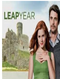
Amy Adams & Matthew Goode