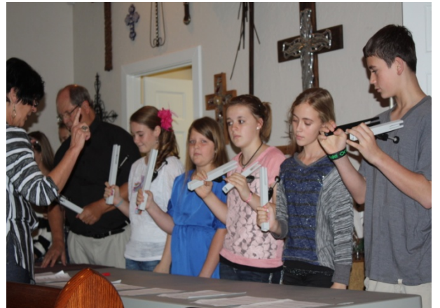
Above are a few photographs of our 2012 Hanging of the Greens Service. Thanks to each who participated.

Matters of Stewardship 12/16/12 General Fund 3065.00 Poinsettias 750.00 Christmas Mission 720.00 Backpack Program 100.00 Attendance ~ 140 In addition, as a matter of stewardship, 140 food boxes were prepared and delivered and two families have already been assisted with Christmas and more to follow.